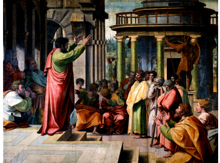
St Paul delivering the Areopagus Sermon in Athens by Raphael (1515)